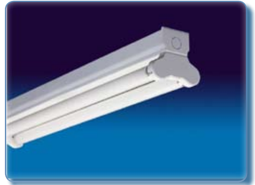
New batten from GET

The Slimline range of battens can be mounted directly on ceilings, walls or suspended by chain or conduit.