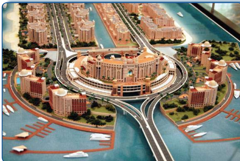
Jumeirah Marina Towers at entrance to Palm Island, Dubai