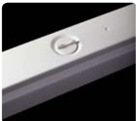
Twist and lock starter

The GET range is supplied in 2ft, 4ft, 5ft and 6ft (61,122,152,183cm) lengths in either single or twin versions. A special feature of the range is that both the single and twin fittings share the same size ceiling fixing footprint.